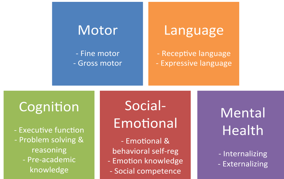
Figure 1. CREDI domains

First, the CREDI measures children’s motor development, or their ability to use fine and gross movements to explore and engage with their environments. Second, the CREDI captures children’s language development, or their ability to communicate their needs and desires, and understand what others are saying to them. Third, the CREDI measures children’s cognitive development, including their ability to pay attention, remember information, perceive and discriminate between objects and people in their environment, solve problems, and acquire basic knowledge. Fourth, the CREDI considers children’s social-emotional development, including their ability to control their behaviors and emotions, understand their feelings, and get along well with others. Finally, the CREDI Long Form also captures early symptoms of children’s mental health , including the absence of behaviors related to aggression, anxiety, and distress. 1